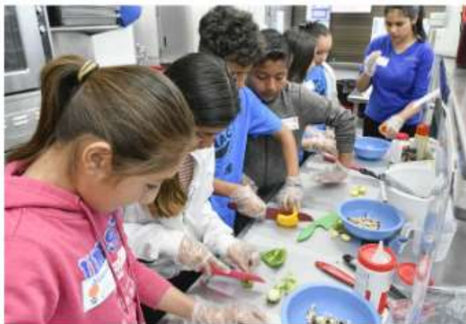
Culinary Academy students learn to chop vegetables on Wednesday at Rice School in Santa Maria.

https://lompocrecord.com/news/local/education/young-chefs-local-students-prepare-and-taste-international-meals-at/article_7cefdc31-cf75-5a0e-92f0-74d37d6cec8b.html#2