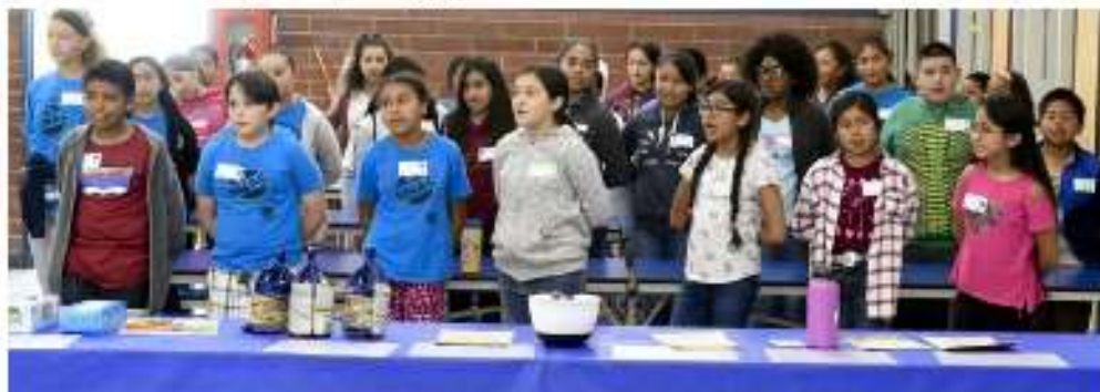
Students recite the 4-H pledge at the start of the Culinary Academy on Wednesday at Rice School in Santa Maria.